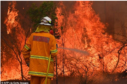
Image: Drought-like conditions across Northern NSW and Queensland coupled with hot weather and winds have hampered efforts to bring more than 120 fires under control.

All is not lost and we can work together with Jesus' help.