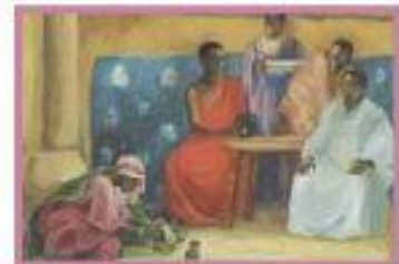
A 'Jesus Mafa' Painting