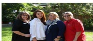
Meet the educators

Come and see the magic in our kinder garden