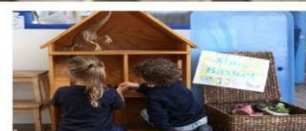
Come inside and take a look!

89 Blyth Street, Altona 9398 2839 altona@ecms.org.au altonakindergarten.com.au