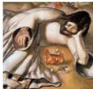
Artist: Stanley Spencer